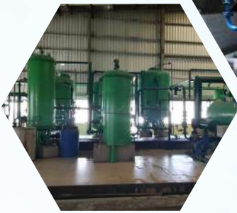
DM Plant at NEFA Breweries, Nirjuli, Arunachal Pradesh