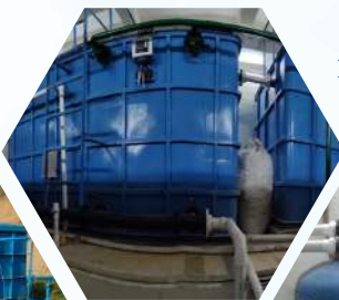
STP at NRL Corporate Office, Guwahati