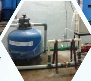
Swimming Pool Filtration Plant at Kaziranga, Assam