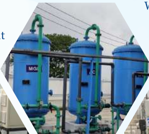
Water Treatment Plant at Brahmaputra Biochem Bottling, Chaygaon, Assam