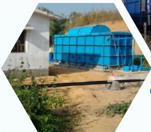
STP at CRPF, Agartala